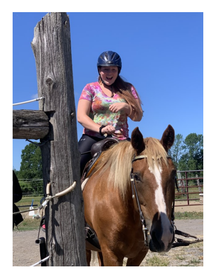
It was so great to be able to share my girl with others again! As you can see she was not spoiled at all....